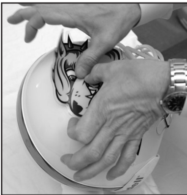
STEPS 1 & 2:

STEPS 1 & 2: Slide your thumbs from the center out to the edges sticking the decal to the helmet. The top and bottom should still be curling up as shown in the photo.