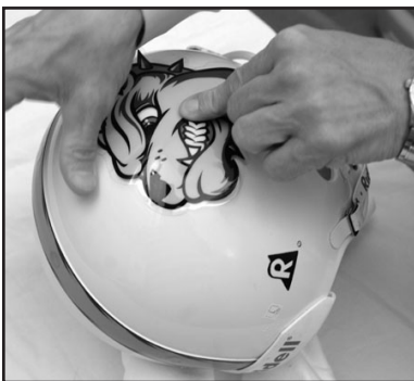
STEPS 3 & 4:

STEPS 1 & 2: Slide your thumbs from the center out to the edges sticking the decal to the helmet. The top and bottom should still be curling up as shown in the photo.