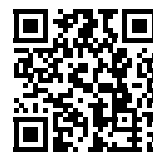
▲ Scan here!